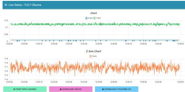
Fig. 4 Live monitoring

Three axis vibration signal energy data is displayed in the chart format. This page also has provision to log the data and download it in .CSV format for further analysis.